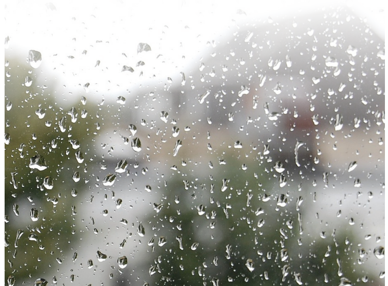
Flaw Fault, imperfect area. Imperfection Blemish, imperfect detail.

If you feel that a flaw is present, please review the following steps (1-2-3) to determine what is acceptable.